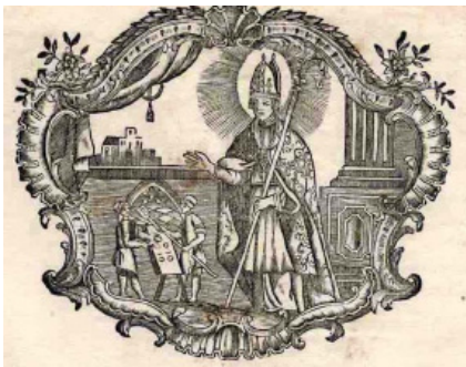
Saint Honoré of Amiens

Did you know that the town of Balzac was named after a famous